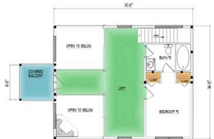
SECOND FLOOR PLAN 603 SQFT