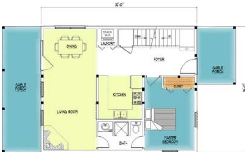
FIRST FLOOR PLAN 832 SQFT